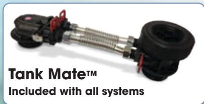
Tank Mate™ Included with all systems